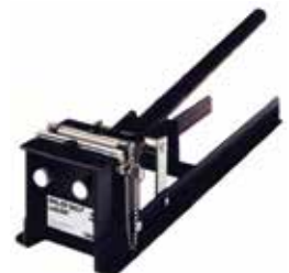
Baler Belt Lacer