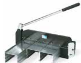
14" Belt Cutter